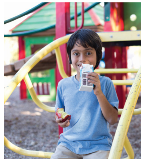
Thank you for helping provide meals to children during summer break.

Food pantries will serve as a much-needed resource for these families and will help them make ends meet. Many of these hunger-relief programs will see an increase in use during the summer months.