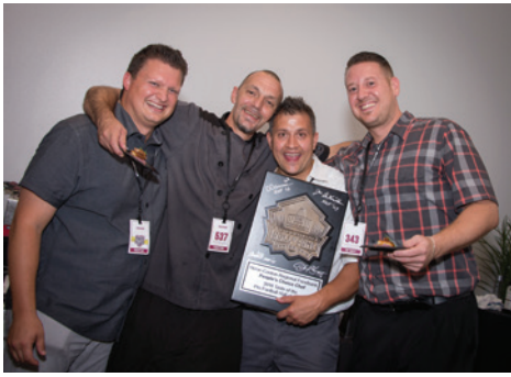
Savor from Canton was crowned the People's Choice Award winner at the event for serving blackened dry sea scallops over purple polenta with blue cheese and candied bacon, garnished with wheat grass.