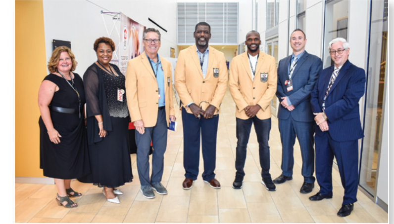
Guests of the Taste of the Pro Football Hall of Fame enjoyed delicious food, exciting auctions and a panel discussion by three Hall of Famers.