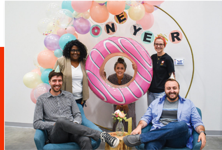
The Stark County Campus celebrated its one-year anniversary of serving the community.