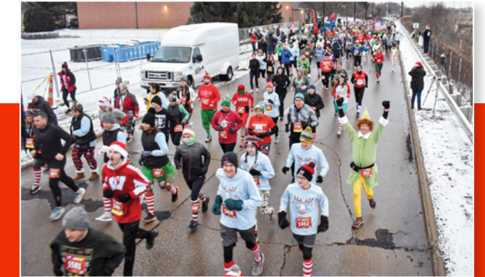
Nearly 900 elves filled the streets of Akron in support of the 10th anniversary of the Selfless Elf 5k run/walk.