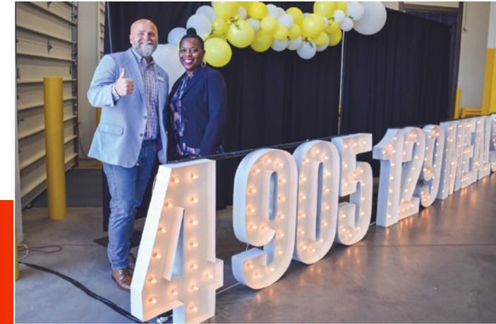
Community leaders and Harvest for Hunger supporters celebrated the campaign that helped raise enough food and funds for more than 4.9 million meals!