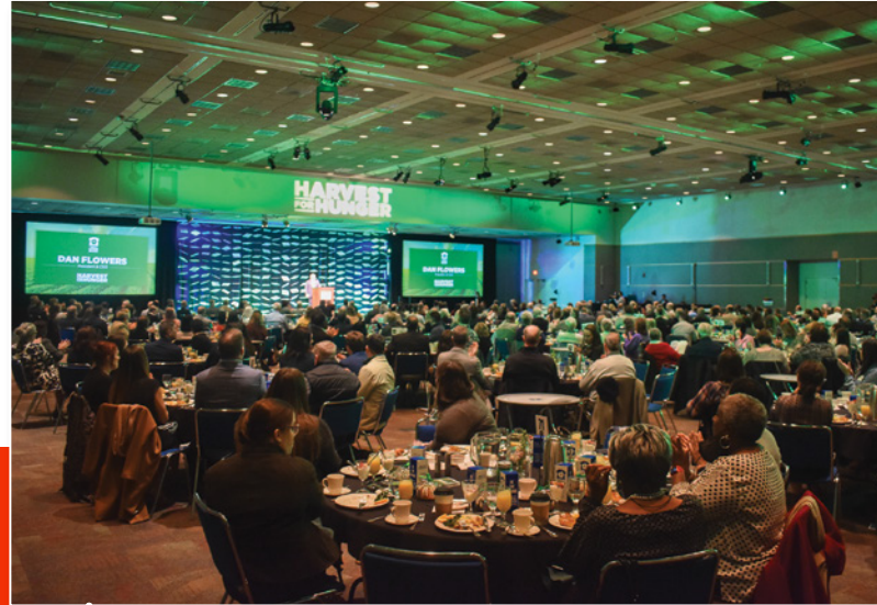
The Harvest for Hunger Campaign Kick-off Breakfast welcomed 350 guests to the John. S. Knight Center in downtown Akron.