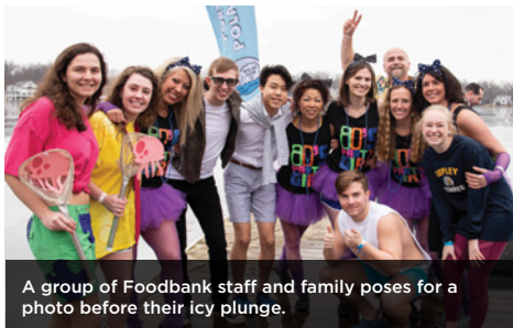
A group of Foodbank staff and family poses for a photo before their icy plunge.