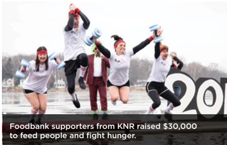
Foodbank supporters from KNR raised $30,000 to feed people and fight hunger.

Thank you to the volunteers at the Portage Lakes Polar Bear Club for all their hard work in making the event a success! The courageous jumpers raised more than $125,000, helping provide 500,000 meals for our local community.